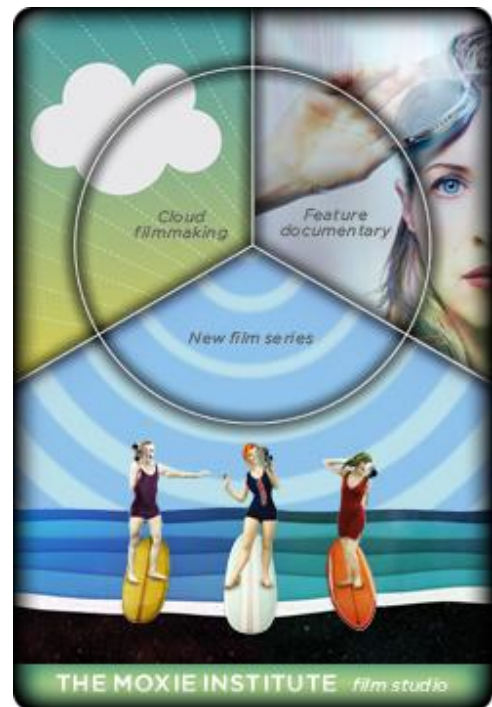
Let it Ripple: Mobile Films for Global Change